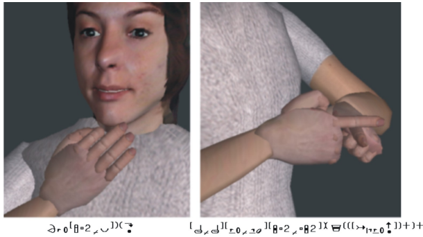
Figure 5: The variants of the dominant hand relationship. On the left is close relationship between index finger and chin, on the right is precise contact of index fingers.

tive movements are notated as base movement with modification to determine the path of wrist, for example small straight movement followed circular fast movement with the decreasing diameter. The local movement, as “finger-play” or wrist movement, are considered as relative movements and are fully implemented.